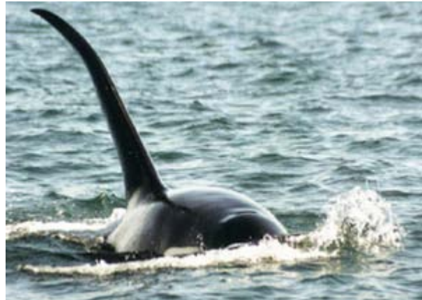
The Dorsal Fin of a Large Male