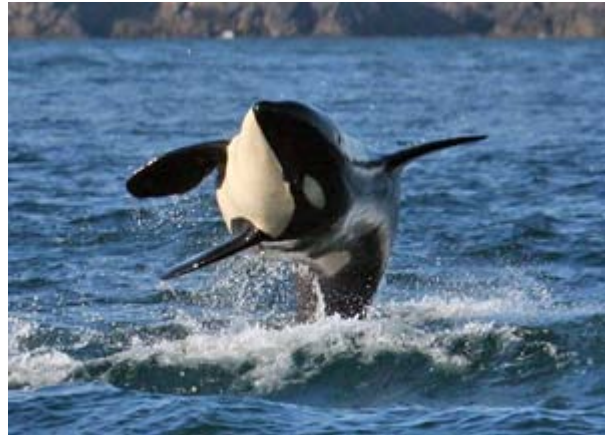
A Transient whale in pursuit of a meal

I always tell visitors to Victoria and Vancouver Island that there are four world class tourism activities to take part in while in Victoria. One of those is the incredible whale watching that is available. Between May and September, there are three resident whale pods that travel the waters near Victoria: J, K, and L pod - between 80 and 100 whales, in all. On two different occasions I had the great fortune of being in a location where all three pods came together. It was a spectacular display of breaching and diving and all of the other behaviors shown in the pictures in this article - over and over again.