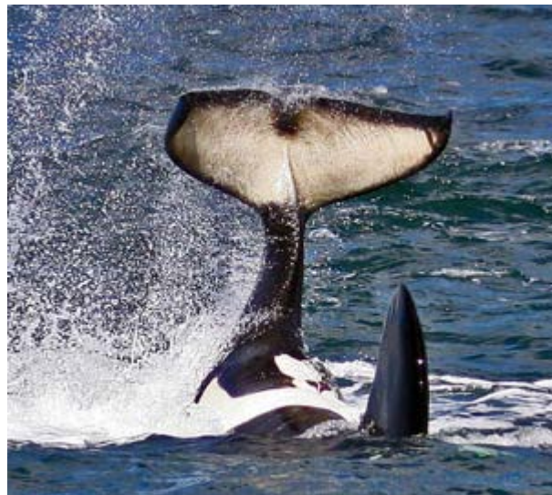
A whale tail slapping

The hundreds of people that go whale watching each trip believe that they are watching the whales. Guess what? The whales are watching you, too. They're often seen "sky hopping". This is when they come up and have a good look around. Sometimes, they do this right by boats and certainly seem to be checking everyone out.