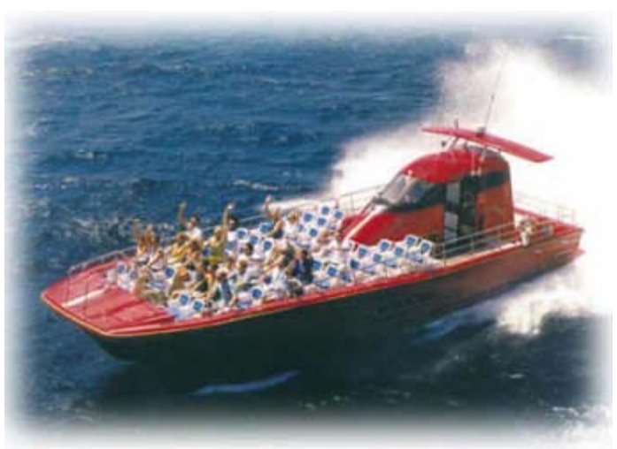
A highspeed catamaran

There are a number of ways to get to the whales. All of them go fast. If you want pure excitement, there is nothing better than the Zodiac Style, rubber-inflatable hard-bottom boats. If you like comfort, then you may choose a boat with a cabin on it. There are lots of choices as can be seen below, so check them all out. You might want to ask what you do when you have to go to the bathroom, as you will be on the water for three hours. You might also want to plan ahead, so that you don't need to go to the bathroom. Bon voyage! Enjoy one of our world class activities. Check out these whale watching companies on our web site.