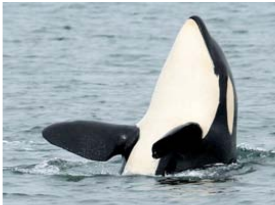
Sky Hopping Whale

I always tell visitors to Victoria and Vancouver Island that there are four world class tourism activities to take part in while in Victoria. One of those is the incredible whale watching that is available. Between May and September, there are three resident whale pods that travel the waters near Victoria: J, K, and L pod - between 80 and 100 whales, in all. On two different occasions I had the great fortune of being in a location where all three pods came together. It was a spectacular display of breaching and diving and all of the other behaviors shown in the pictures in this article - over and over again.