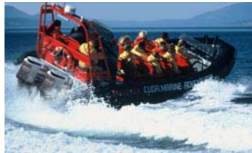
Zodiac style hard bottom inflatable