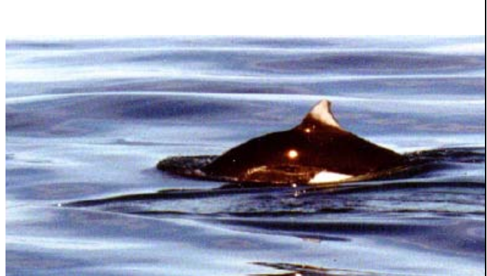
Porpoise, common in our waters