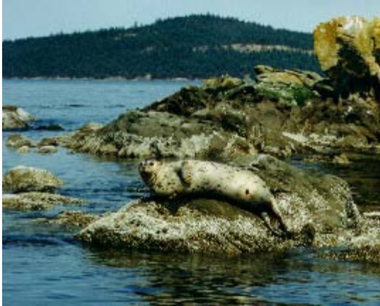
Seals are a common sight in our waters