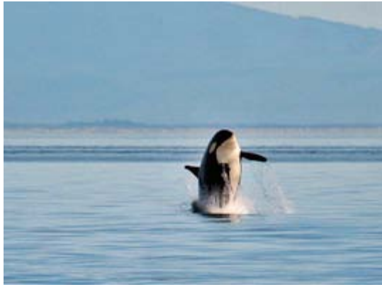
A Breaching Whale