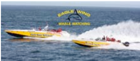
High Speed fiberglass boat

There are a number of ways to get to the whales. All of them go fast. If you want pure excitement, there is nothing better than the Zodiac Style, rubber-inflatable hard-bottom boats. If you like comfort, then you may choose a boat with a cabin on it. There are lots of choices as can be seen below, so check them all out. You might want to ask what you do when you have to go to the bathroom, as you will be on the water for three hours. You might also want to plan ahead, so that you don't need to go to the bathroom. Bon voyage! Enjoy one of our world class activities. Check out these whale watching companies on our web site.