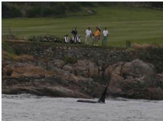
Whales passing the shoreline near the Victoria Golf Course

One of the most spectacular activities is the breach. When a whale jumps clear out of the water, you can hear the ooohs and aaawws coming from all of the human spectators. It is very difficult to catch these breaches in pictures because they happen so fast. When the males grow into adulthood, their dorsal fins become huge. It is one of the ways that you can see the whales coming from far off. They are black and sometimes hard to see in the water, but not when there is a large dorsal fin heading your way.