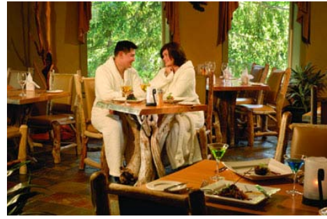
The Tree Top Tapas Lounge and Grill

lounge for ladies only. While relaxing, I complete my health screening form for my therapist. In a short while Reighlynn and Ivy, our treatment staff arrive to greet us and take us to our respective treatment rooms. Ivy, my massage therapist reviews my medical information, asks a few pertinent questions and then begins to weave her magic. Magic fingers, warm towels, scented oils and sprays and beautiful calming surroundings quickly transform me to something akin to butter under a heat lamp. The downside to a great massage is that it has to end. After the massage, my voice drops an octave telling me how well it worked. The resort advertises “experiences that go beyond the expected” and they do deliver! I go back to the lounge to meet Linda. Her pedicure includes an additional hand and arm massage. She