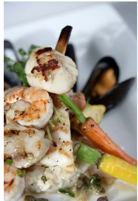
Great food is on the menu