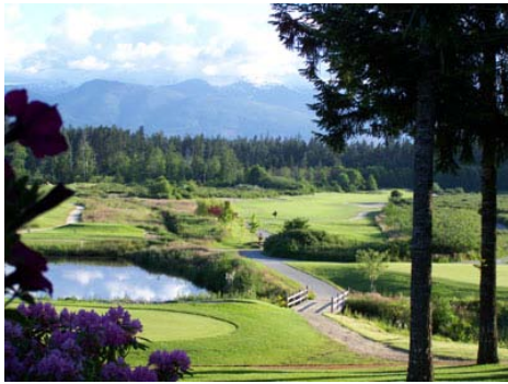
Scenic Golf Course Nearby

Linda chooses a Farmer Mornay and I choose the Tigh-Na-Mara “Big Breakfast”. Mistake number two. There is enough food for a basketball team. It includes a pancake, fried potatoes, two Hillier (local) sausages, two strips of bacon, toast and two eggs. It comes on a platter almost as wide as the table. Talk about having ‘eyes bigger than your stomach’. The multigrain pancake is Frisbee-sized. Needless to say, I go down in flames. It is very good and I truly enjoy what I can eat. Linda’s delicious Mornay includes poached eggs with sautéed Portobello mushroom, tomato and spinach in a Mornay sauce on a split scone with yummy fried potatoes and fresh fruit.