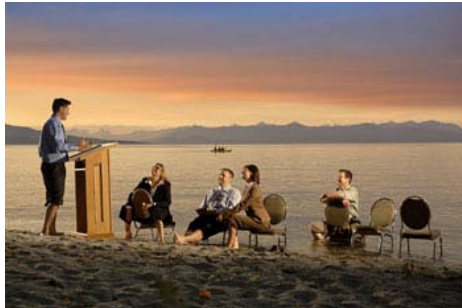
Meeting at the Beach

Christmas and New Year’s Eve are over and it is time to get back to business. We decide to visit Tigh-Na-Mara Resort near Parksville to discover yet another Vancouver Island get-away. As we travel the Malahat Drive there is a blanket of fog over Saanich Inlet and we stop at Split Rock Lookout. The view is mystical. Trees and mountaintops peak above the thick fog bank, so white that it looks like an alpine snow field. What a gorgeous sight!