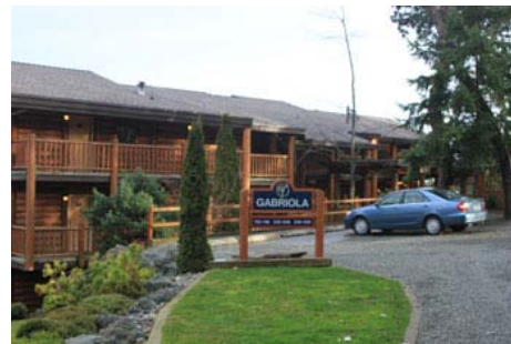
The Gabriola Beach Front Condo

We drive a short distance through the beautifully treed property past individual cottages. Our destination is the low rise beach-front Gabriola condominium. The 22 acre property is enormous yet you are never very far from access to 3 kilometres of sandy Rath Trevor Beach with the warmest ocean swimming available in Canada. There are 192 traditional log constructed accommodations with 50 Spa Bungalows, 41 Private Log Cottages, 12 Forest View Studio Units and 89 Oceanfront Condominiums.