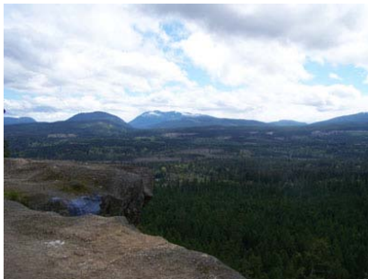
Spectacular View of Mt. Arrowsmith from Little Mountain

From previous trips to the Parksville area, we know there are lots of fun things to see and do. The resort can keep guests busy with an indoor pool and fitness centre, the Grotto Spa, yoga classes, tennis, basketball, walks on the beach, swimming in the ocean, relaxing along the shore, walking and cycling trails, oyster picking, barbeques and much more.