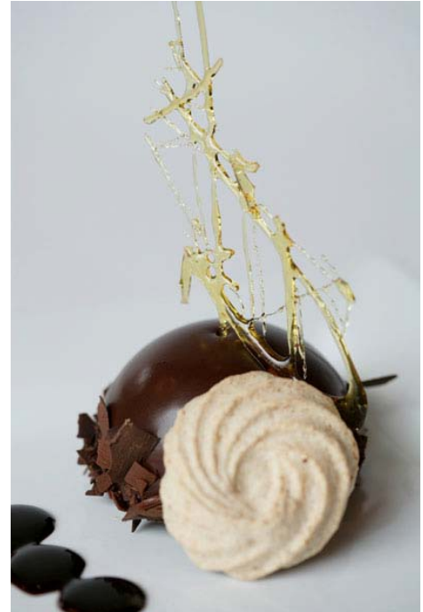
Chocolate Espresso "Bombe"

I wake early to catch the sunrise, but alas, it is a cloudy but warm day. We are off to the Cedar Room for breakfast. Trevor, our server is cheerful and helpful for so early in the morning. Every staff member we encounter on our stay is so friendly, polite and approachable. We are truly impressed. This surely reflects well on the management of the resort.