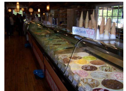
Coombs Country Market Ice Cream Bar

leave until you try a cone from their massive ice cream bar.