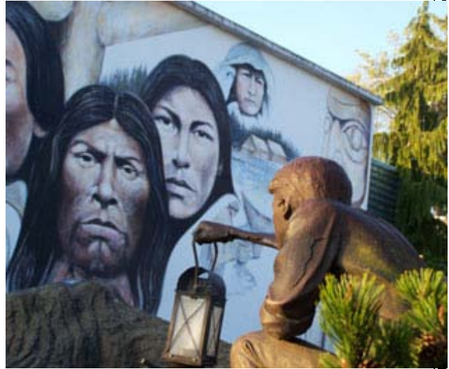
One of the great murals in Chemainus - viewed from the statue nearby