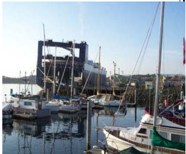
A Norweigan Cargo Ship loads in Chemainus

At Lynne's recommendation, we go down to the docks to tour an "open boat" - a mission boat that visits communities all around Vancouver Island and up the mainland coast. Uncle Roy provides a