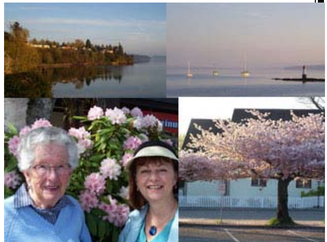
Chemainus is beautiful with ocean views and flowers