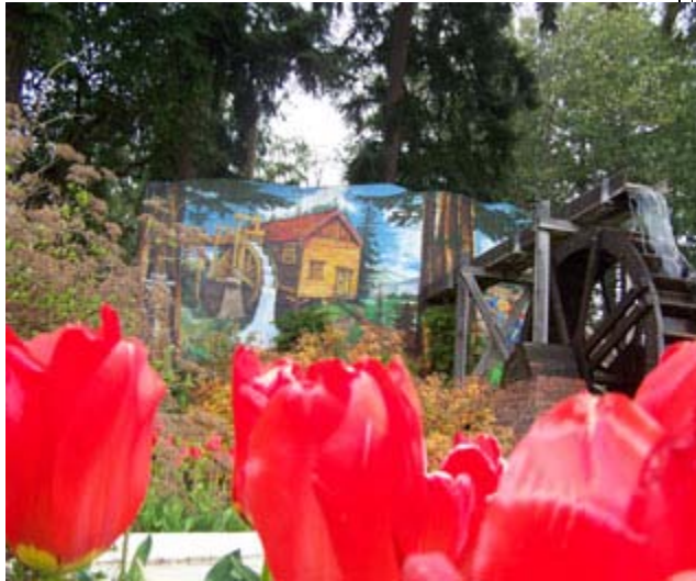
Waterwheel Park between Downtown and Old Town

great tour and it appears that they do great work for people in remote communities. Check out the boat and the mission work they do at the Coastal Missions Web Site . While we are there, an enormous Norwegian cargo ship with a hold big enough to hold all of Chemainus pulls into the mill to load up lumber. Living on Vancouver Island always provides amazing new stories to follow. This is another great Vancouver Island story.r.