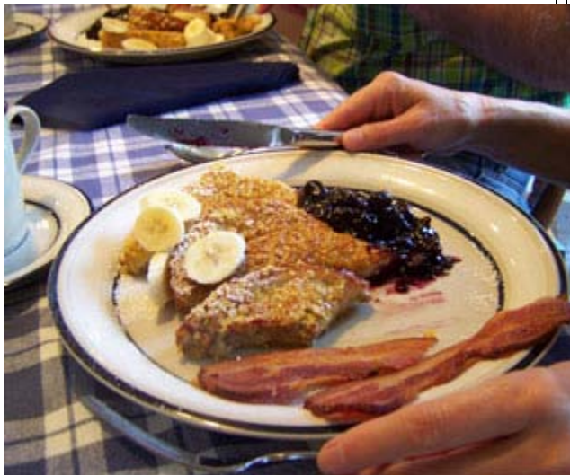
French Toast -mmm good!