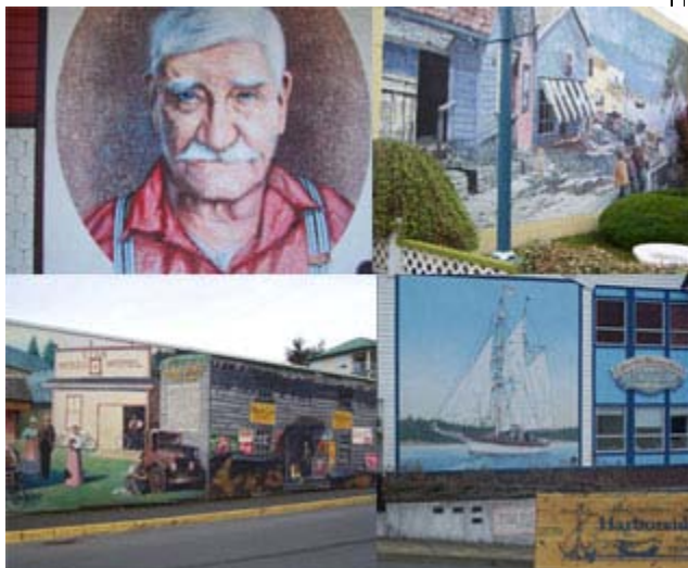
Some of the Chemainus Murals