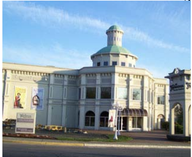
The Dinner Theatre in Chemainus

We spend our afternoon touring the shops downtown and checking out many of the spectacular murals. There is a horse-drawn carriage that provides an expert tour of the murals explaining much of the history. Then we go to the old town part of Chemainus, just down the hill. Too many people miss this part of town. There are shops, restaurants and a great bakery down here. Don't miss it.