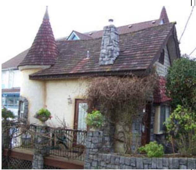
Unique Architecture can be found throughout Chemainus

Chemainus is in the North Cowichan area. There is so much to see and do. Scuba diving, kayaking, hiking, and much more await visitors to this great little town. I urge you to take time to visit Chemainus. You will be glad you did. A stay at A Small World B&B will ensure you have a great time.