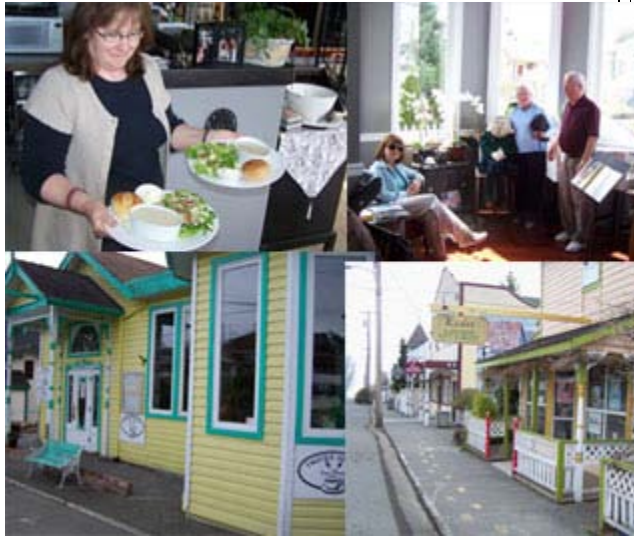
A Light Lunch - Tea Room Lounge - Tea Room Street View & Maple Street