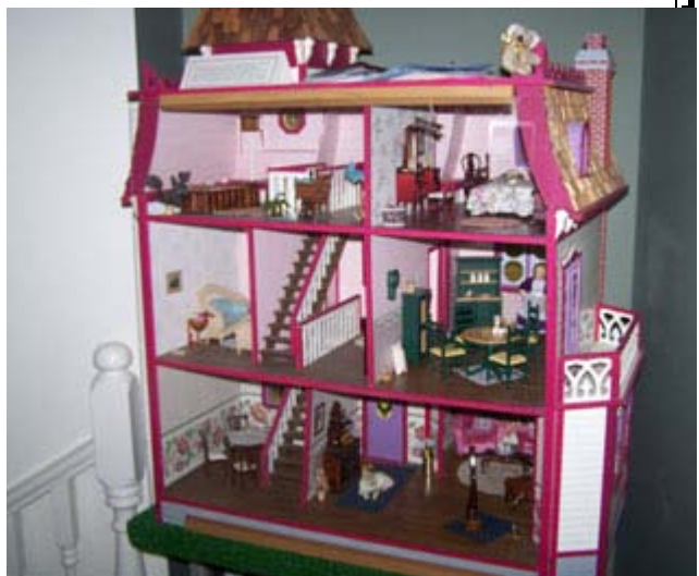
There are a number of these miniatures at the B&B

John and Lynne are a great team for breakfast. Lynne serves us her tasty and sumptuous version of "Eggs Bennie" and then "French toast". Oh, my - they are good! (see photos above). Fresh fruit in yogurt, scones, muffins and superb main courses are something you can expect at breakfast in A Small World.