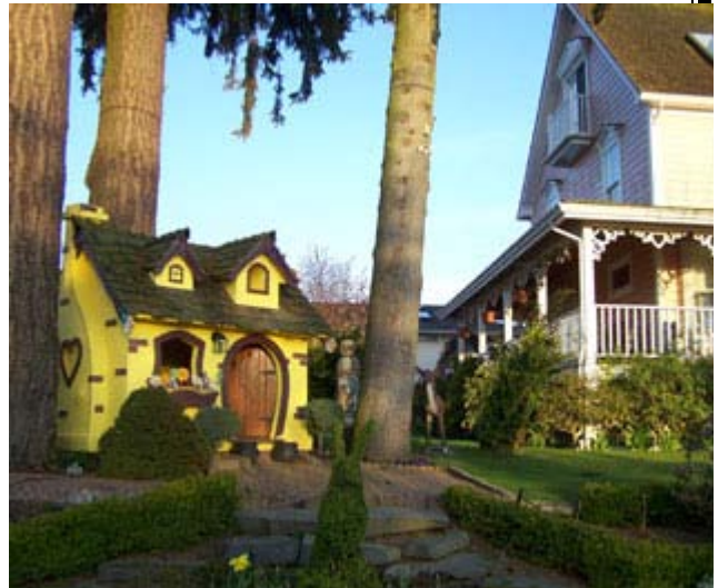
A doll house outside a former B&B in Chemainus