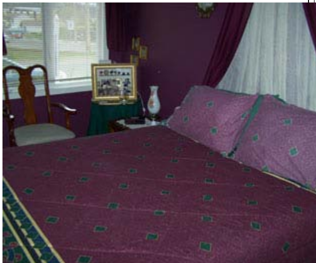
One of the 3 Rooms at A Small World