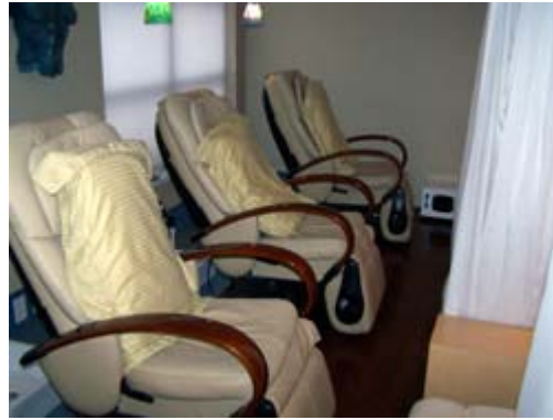
Pedicure Area

Tasmin leads me to the Pedicure area where several massage chairs sit in a row, separated by billowy white curtains for privacy (or to envelop groups that come here to share the experience). I sit near the glass fountain and Tasmin brings me another cup of herbal tea. The sound of running water soothes me as my feet soak in a warm sea bath. The chair massages my back as Tasmin treats my feet to a vigorous salt scrub, shapes my cuticles, and rubs away my calluses. She wraps my happy feet in a warm Spirulina mask and gives me an aromatic foot and lower leg massage. Then, she removes the mask and finishes off by polishing my toenails.