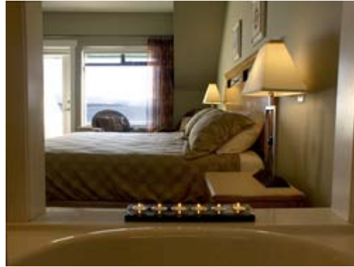
Jetted Tub with View to Room and Ocean

Back in my room, I light candles in the bathroom and take a long bath. I watch the storm outside the window. Lights flicker on the water, threatening to go out. Later, I fall asleep to the sweet music of storm waves drumming on the beach.