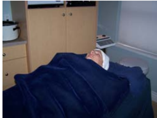
Soaking up the Spirulina Body Mask