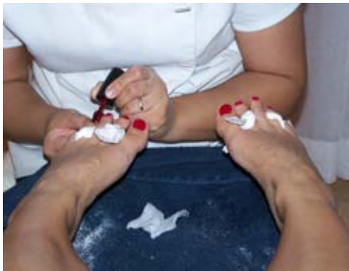
Happy Feet at the Ocean Palm Spa