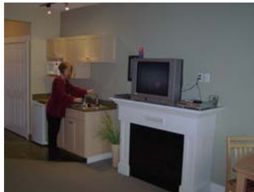
Making Tea in my Kitchenette

I unpack my things and set out for the Ocean Palm Spa, just down the hall.