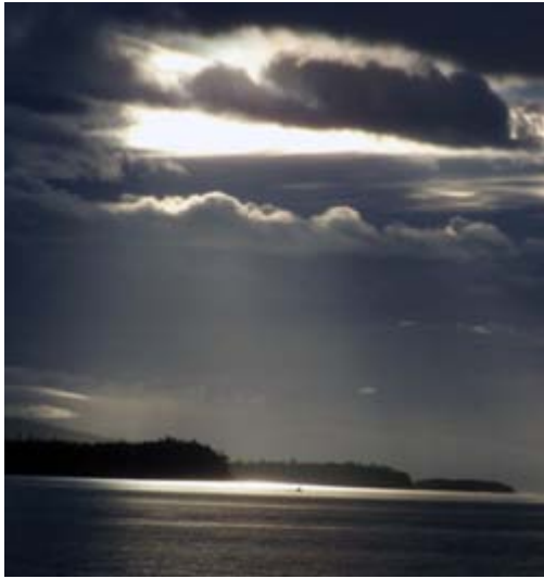
The Morning Sun Beams through the Clouds

I go for a long walk along the Waterfront. I wander up Beacon Avenue and stop at the bustling Bakery to pick up a few goodies. I visit the armistice display at the Sidney Museum and chat with the delightful volunteers. I window shop at the bookstores, wanting to linger a little longer in this place of gentle pace.