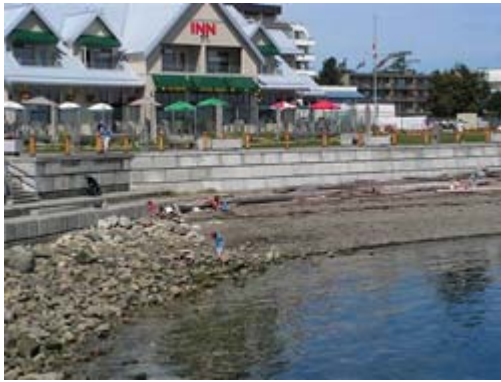
Sidney Waterfront Inn and Beacon Landing Restaurant

Unlike some people who seem to breeze through the process of getting their wisdom teeth out, I had a difficult time of it. My face swelled to twice its normal size and the pain was unbearable. And, as soon as I started feeling better, I had to catch up with several project deadlines. Needless to say, when the work was done, I was feeling frazzled. I needed to get away for a day, to unwind and let my face heal. Luckily, I live in Victoria, BC, where one doesn't have to go far to escape the busyness of city life. When Sidney's Waterfront Inn, Ocean Palm Spa, and Beacon Landing Pub teamed up to offer me a twenty-four hour getaway, I took them up on it.