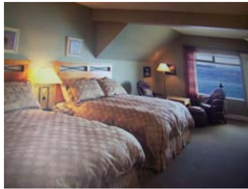
Deluxe Waterfront Rooms Cannery Building - Sidney Waterfront Inn

Sidney by the Sea is a beautiful little seaside town on the Saanich Peninsula of Vancouver Island, just twenty minutes from Victoria. With its laid-back, leisurely pace, it makes for the perfect escape, whether you're coming from Vancouver or Victoria, Seattle or Los Angeles, or anywhere!