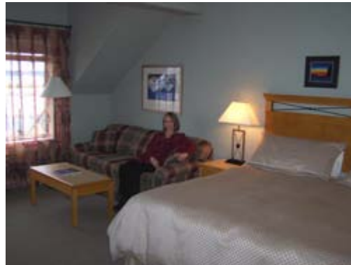
My Room

My room is cozy and inviting. The ocean view fills my window to overflowing. Outside, the wind picks up, ruffling the waves. Across the water, Washington's snowcapped Mt. Baker is so clear that I feel like I can reach out and touch it.