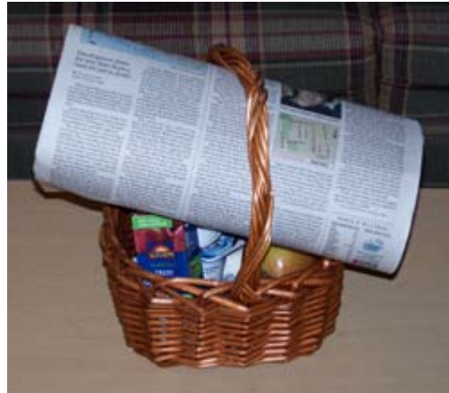
Breakfast Basket full of Goodies

I awake to a calm ocean. The clouds open and the sun beams down for a moment. It's as if Heaven has come to Earth. I open my door and find a breakfast basket outside, stuffed with fruit, yogurt, juice, muffins, and today's paper. I drink tea and munch breakfast with my patio door open, watching the sights. Seagulls are fishing. Sooty black cormorants preen and stretch their wings. A seal's head emerges from the rippling water, then disappears.