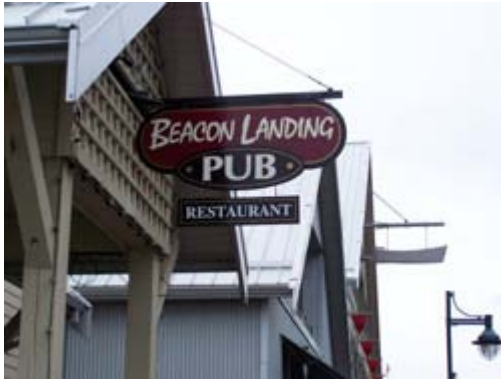
Beacon Landing Pub