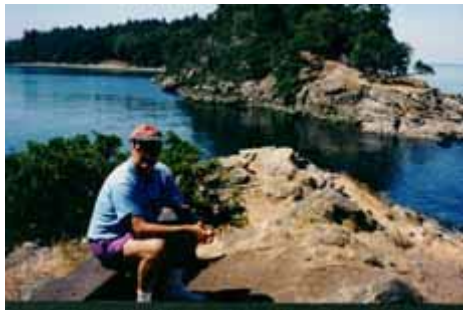
Fabulous Boat Pass in Winter Cove

Our adventure began with a one-hour ferry ride from Swartz Bay to Lyall Harbour. We arrived late in the afternoon, had a quick tour of Winter Cover Marine Park (one of the most beautiful spots on Saturna and the site of the July 1st Lamb BBQ) and drove to our accommodation at East Point Resort.