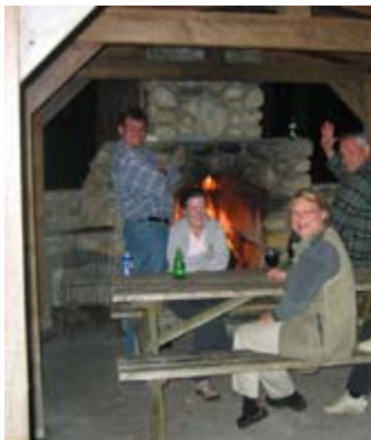
Staff & Owners at East Point Resort

Thoroughly satiated, we headed back for a great night's sleep next to the water's edge at East Point Resort. When we arrived, the owners and managers of the Resort already had a roaring blaze going in the outdoor fireplace. We shared a bit of their wine and great company for a few hours before retiring. Good food, great company and comfy accommodations - Our trip was off to a fine start!