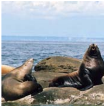
Sea lions in Georgia Strait

generally scatter as boats approach, but the magnificent Stellar and California sea lions seem unperturbed. They raise up on the rocks and roar with defiance. On one other occasion when we were near sea lions, a brash young male came towards our boat and rose up out of the water and hissed at us. We did the noble thing and left the area, immediately!