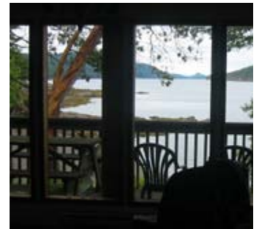
Fabulous View from East Point Resort Cabin

Thoroughly satiated, we headed back for a great night's sleep next to the water's edge at East Point Resort. When we arrived, the owners and managers of the Resort already had a roaring blaze going in the outdoor fireplace. We shared a bit of their wine and great company for a few hours before retiring. Good food, great company and comfy accommodations - Our trip was off to a fine start!