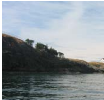
East Point

After the vineyard we worked our way down to Saturna Beach. We saw feral goats on the slopes just beside the beach and they created quite a dialogue with us as we waited for our next adventure.