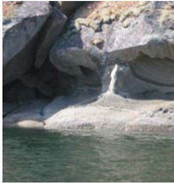
Caves on Tumbo Island

including rare books, maps, prints, mining & geology texts, northern Canadiana, classic jazz memorabilia, antique musical instruments, willow pattern dishware and much more. Paul makes his collection available on Ebay. I was pleasantly surprised by the quality of artists and artisans on the Island.