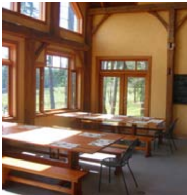
The Bistro at Saturna Vineyards

blooming rosebushes planted at the ends of each row of grapevines. Presumably, the roses attract the bugs away from the grapes.