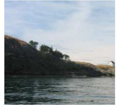
East Point

Just steps from East Point Regional Park, we had an ocean view cabin with a spectacular view of the entire East side of Saturna Island. The view was to die for. We checked in and headed off to Saturna Lodge for an evening dinner. The manager, Ingrid Gaines was there to greet us and we thoroughly enjoyed our three-course dinners. The scallops