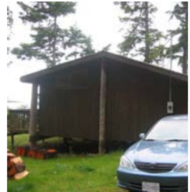
Oceanfront Cabin at East Point Resort