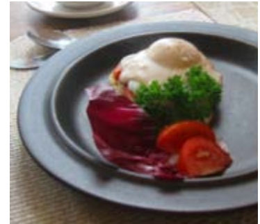
Gourmet Breakfast at Lyall Harbour B&B