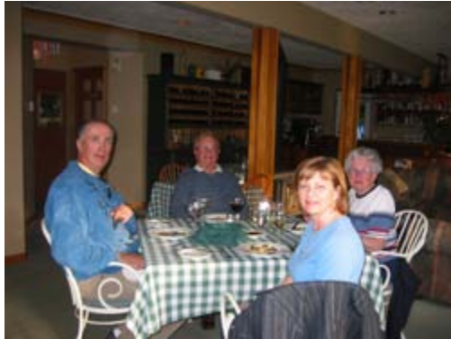
Fine Dining at Saturna Lodge