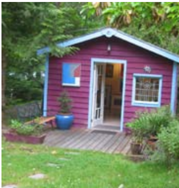
Gallery Rosa