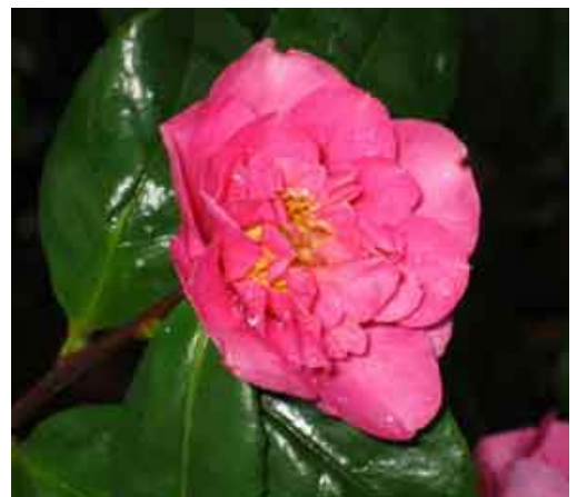
Camelia in full blossom

Each walk I pass through spring fragrance that almost takes my breath away. There are rhododenrons that are starting to blossom. Although they are just in the beginning stages, it will not be long before the gardens start to fill with color.