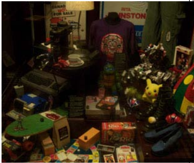
Toys in the Modern History Gallery

There is also an incredible gift shop and a good quality café here as well. We are excited to see the Museum, so we head up to the third floor, doing the plan in reverse. We enter the First People's Gallery and become quickly absorbed by the tremendous history of our native population. We are amazed by the Pit house and then the incredible poles outside the big house. All the way through the gallery there are incredible displays. Be sure to have lots of time so you can properly view them and read what has been prepared. It is an amazing adventure. There is a mask display with an audio-visual presentation also worth watching in the First People's Gallery.