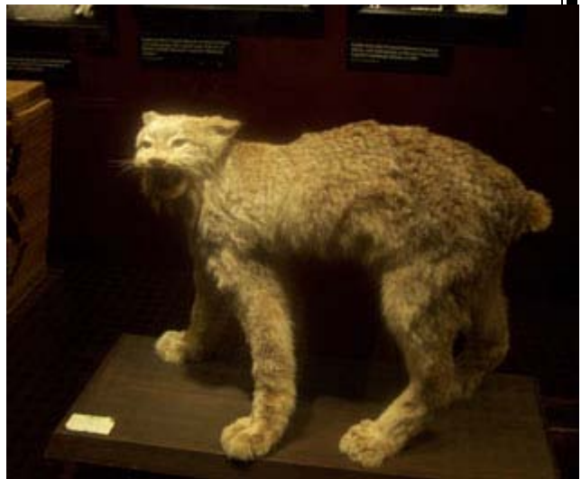
A Bob Cat in the Modern History Gallery

Next, we go through the Modern History Gallery. Many of the displays are early in the century and truly amazing. There is part of old town Victoria, China Town, a cannery and the HMS Discovery. There is an incredible bright red leisure suit in a clothing display and a bob cat. The hills surrounding Victoria have bear, cougar, and other critters. It was not long ago that a cougar was discovered in the parking lot at the Empress Hotel, just across the street!