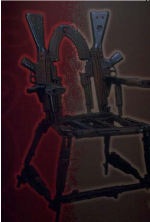
British Museum Display - chair made from weapons

Starting May 1st and running until September 30th, an exhibition titled: "Treasures: the World's Cultures from the British Museum" will be in town. This exhibit will display over 300 artefacts from the collection of the renowned British Museum. Included are an Egyptian mummy, a shield from the Bronze Age, works from Picasso and Rembrandt, and a whole lot more. I would suggest that you take this in if you are going to be around. Most of these exhibits have drawn people from all over the world, so don't miss out. They do not go to very many museums. Victoria is on the "A" list because they do such a good job.