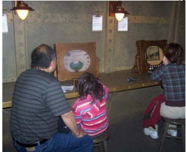
The Ocean Station is really hands-on

Photo courtesy of the Royal BC Museum All images © The Trustees of the British Museum.