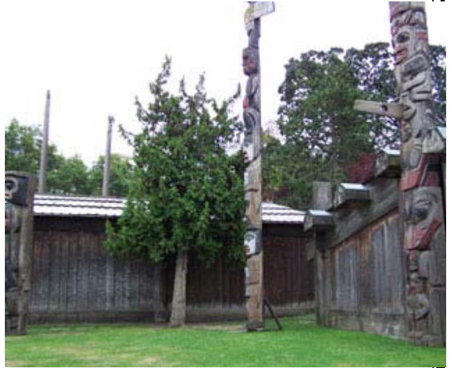
Totem Park and Long House Outside the Museum