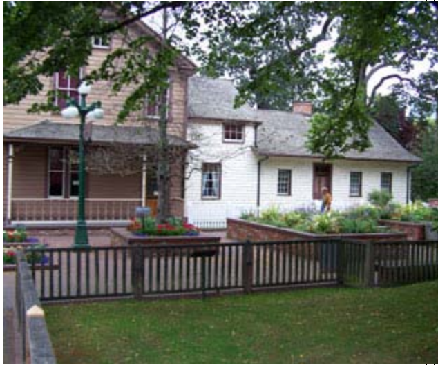
The Historic Village featuring Helmken House (outside)