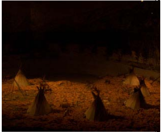
First Nations Village BC Interior Display