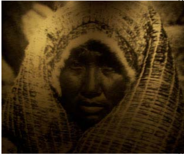
First Nation Women Picture in Gallery