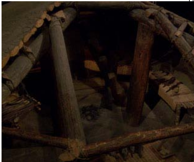
The Pit House

Many people ask me this question. I am only in Victoria for 2 or 3 days, what should I do? Well, I tell them that Victoria has 4 world class tourist attractions, so why not try fitting them in. The most highly promoted of these is Butchart Gardens. It is truly world class and will take half a day to see it all. Our area also has resident Orca (Killer) Whales living in our waters from May to September. This is one of the best opportunities to see whales. Victoria has often been cited for its world class environmental ambiance. It is worth taking one of the Victoria tours. If you get good weather, then be sure to ride in a double-decker open air bus, so you can soak it up. To the east is beautiful Mount Baker, to the South is Juan de Fuca Strait and the Majestic Olympic Mountains and to the west is the Sooke Hills wilderness area. Viewing is spectacular and certainly world class. The fourth attraction is the Royal BC Museum and National Geographic IMAX Theatre. That's where we're off to today.