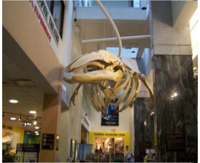
A Whale Skeleton