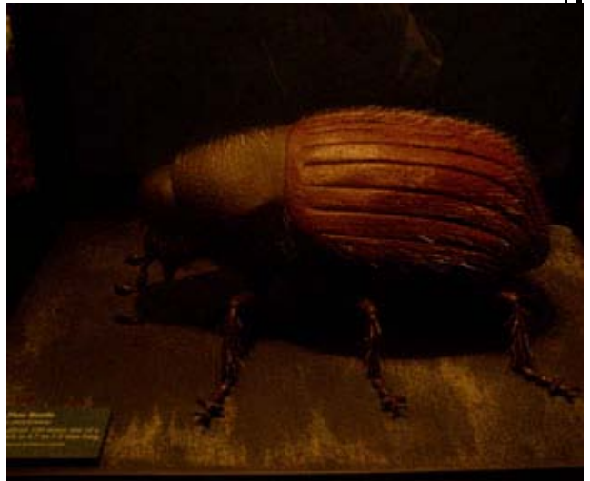
A Pine Beetle Display - they have desimated BC Forests