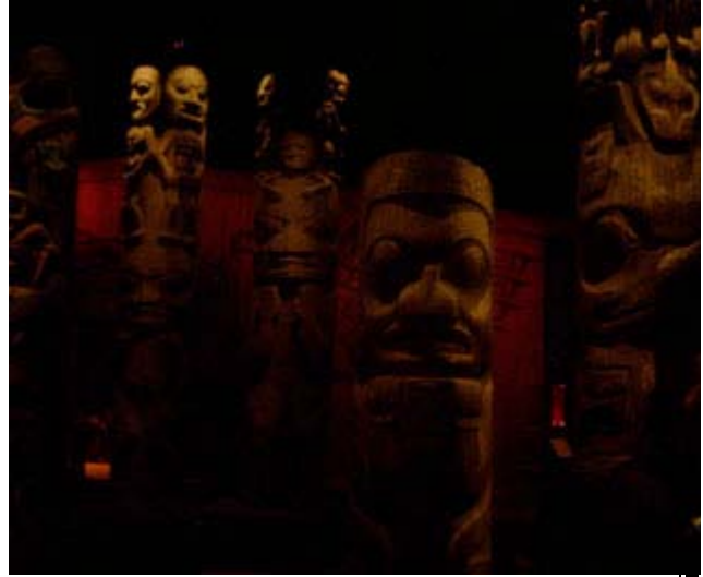
Totems outside the Big House