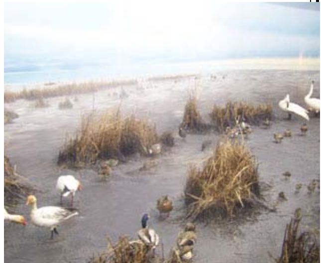
A bird marsh display - it looks so real (display)

Then we are off to catch the noon show at the IMAX theatre. It is all about extreme sports and very exciting. I have taken in a good number of IMAX shows and have never been disappointed. Watching shows on such a large screen makes you feel like you are there. However, I did find Keith Richards of