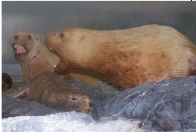
A mother sealion protecting her young (display)

Then we are off to the Living Land, Living Sea Gallery. We are soon greeted by a life size Ice Age Mammoth. Next is an incredible life-like display of sea lions in a coastal setting. This floor also contains a forest diorama which has incredibly lifelike trees, deer, etc. The Ocean station is amazing. Young children are working the stations and learning amazing things about our undersea life. You would swear you are 30 feet under the sea in this display. The other displays in this area are truly amazing. In fact, all the displays are amazing. Each has its own interesting story. I certainly find my favourites, and you will, too.