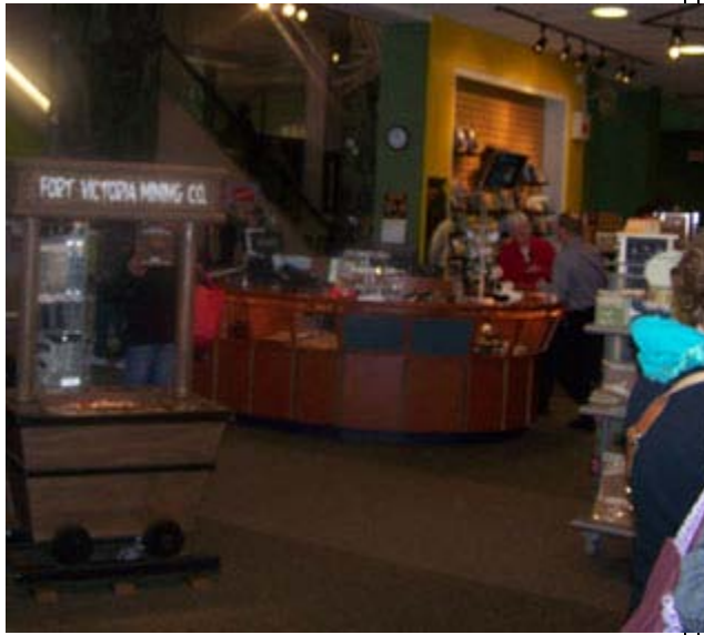
The Museum Gift Shop