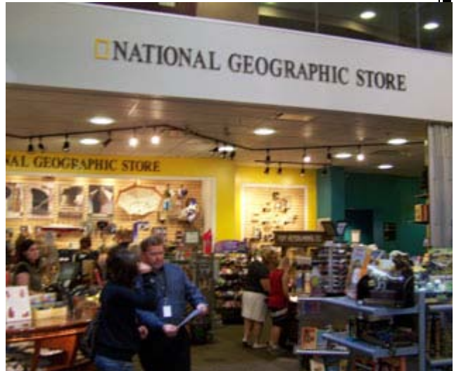
The National Geographic Store

Then we take time out to peruse the Museum Gift Shop. Some of the First Nation art works are beautiful. There is something for everyone in the gift shop, from T-shirts to jewellery and a whole lot more. Since we've filled up on popcorn, we skip the café this time around.