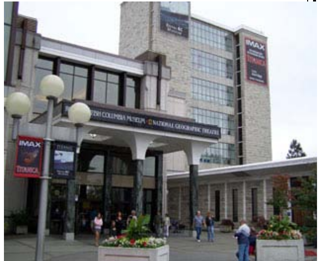
The Royal BC Museum and National Geographic IMAX Theatre