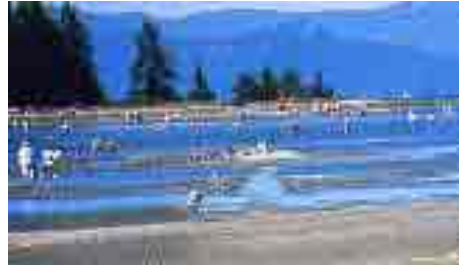
Play on the big beaches at Qualicum Beach

When we arrive at Qualicum Beach (which means, "where the dog salmon run"), the last image that comes to mind is Dog Salmon. Qualicum Beach is a quaint village in the middle of absolute paradise. Everything is beautiful from the endless expansive sandy and pebble beaches to the beautiful snow-capped mountains that provide a backdrop to the area. The town has worked hard preserving its heritage which is obvious walking through the downtown area. A heritage style design is predominant, providing a friendly village atmosphere. Everywhere we go from the spectacular heritage designed Quality Foods grocery store to the funky Smithford's, we meet very friendly people.