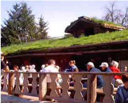
Coombs Country Market - goat are in the little hut on the roof.

The area boasts some of the best of BC Provincial Parks. If you like to camp, hike, explore the beach or visit spectacular waterfalls you should check out Rath Trevor Beach Provincial Park, Englishman River Falls Provincial Park, Little Qualicum Falls Provincial Park and Cathedral Grove Provincial Park. Other attractions can be found throughout the area by checking the web at http://tourismmall.victoria.bc.ca/aavanisle/pgattract.htm