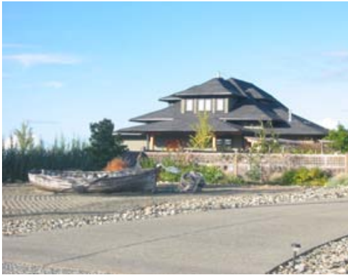
One of the beautiful homes along the sea shore

Now we are settled in to our cabin by the sea. Besides the obvious, we check around to see what we can do while we are in paradise. Locals inform us that you can beach walk almost continuously for about 50Km (30 miles) along the coast line with the exception of interruptions by two rivers, the Englishman and French Creek. When the tide goes out, it feels like we can walk half-way to the mainland.