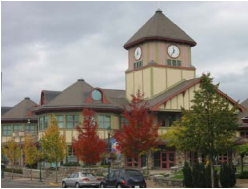
The town hall in Qualicum Beach

Finding a place to stay is not difficult. The area has an abundance of accommodations from bed and breakfasts to motels and resorts. We chose the Seaview Beach Resort because we are having a family get-together. The quaint cottages range from 1-3 bedrooms and come fully equipped. When we walk out our door, within seconds, we are right on the beach. The Seaview is well off the road and sits among modern residential properties. It is very quiet and peaceful. Across the road we discover a large Federal Wild Life Sanctuary. As we walk down the beach and the roadway we are drooling over incredible new oceanfront homes. My wife is scoping out the fire pit where she will roast her marsh mellows just as soon as the sun goes down.