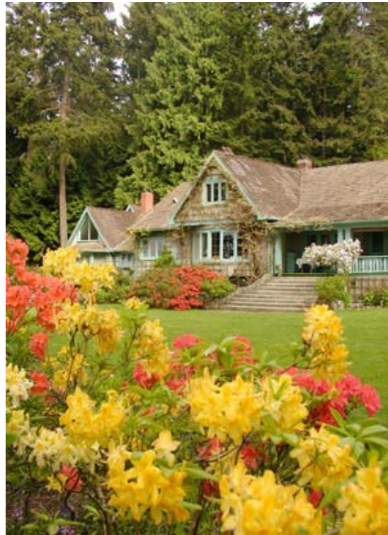
Tea Room at Milner Gardens in Qualicum Beach

Finding a place to stay is not difficult. The area has an abundance of accommodations from bed and breakfasts to motels and resorts. We chose the Seaview Beach Resort because we are having a family get-together. The quaint cottages range from 1-3 bedrooms and come fully equipped. When we walk out our door, within seconds, we are right on the beach. The Seaview is well off the road and sits among modern residential properties. It is very quiet and peaceful. Across the road we discover a large Federal Wild Life Sanctuary. As we walk down the beach and the roadway we are drooling over incredible new oceanfront homes. My wife is scoping out the fire pit where she will roast her marsh mellows just as soon as the sun goes down.