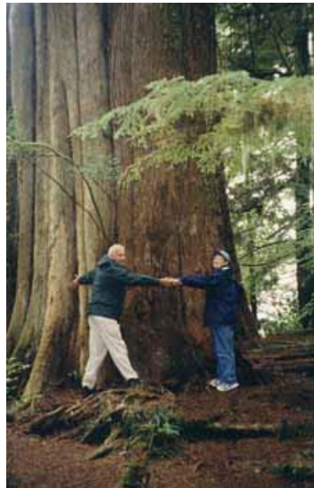
The giant trees on Meares

Take the water taxi to Meares Island to see the giant trees. The first real "war over the woods" was staged here to save these magnificent giants. It is about 15 minutes by water taxi to the drop off point just below the island boardwalk. They leave you there and come back in 90 minutes. This is ample time to walk into the island and see these special trees (shown on the right). They are monsters, hundreds of years old. There is a boardwalk all the way to the trees and lots to see. This is a beautiful area but always remember you are in a rainforest zone and rain can come at the most inopportune times- dress accordingly! The periodic rain does not deter the million or so visitors that come to this area every year. You'll see why. A good water taxi guide will also give you a bit of a tour on the way out and back. The boat ride is only about 15 minutes from the docks. The water taxi is usually an open boat.