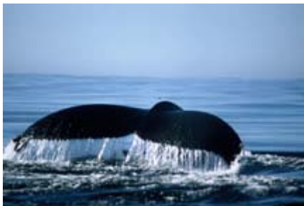
grey whale tale

I have tons of great memories: long walks on spectacular beaches, watching the great tail of a grey whale diving, flying over this spectacular area, soaking in the natural hot springs, playing in the big surf, the giant trees on Meares Island and so much more! When you go to the Long Beach area, be sure to visit the Wild Pacific Trail in Ucluelet for spectacular ocean views on a very easy walk. Start from the Amphetrilite Light Station. Play in the waves, you might want to rent a wet suit, depending on the weather. The water is cool. Get out on the water (go whale watching or on a sight-seeing excursion).