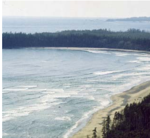
Long Beach - West Coast of Vancouver Island

There are two places on Vancouver Island that are, in my opinion, mystical. When you first set eyes on these special places, the only word that keeps coming to mind is MYSTICAL!