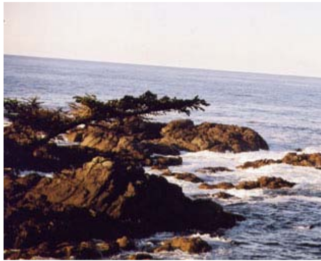
Spectacular Views 'Wild Pacific Trail' Ucluelet

One time, on a family camping trip to the area, a few things went awry. The first night, we realized we forgot the lantern. We picked up a cheap one and it exploded as our son put it together. Then we discovered the propane stove line was almost severed! The next day, the transmission on the van went. While towing it to Port Alberni, the tow truck driver was going down a steep hill and side-swiped a post - with our van. A friend lent me a vehicle so we could drive to Port Alberni, rent a car, then drive back to Long Beach to return his vehicle. Then, we drove the 5 hours back to Victoria, all this driving in one day. (The kids were unimpressed.) This brief summary doesn't do justice to the events that unfolded. It is hard to believe that we actually enjoyed the time we were there with all that happened, but we did. When you go, you'll see why. Now we just look back at this trip and laugh.