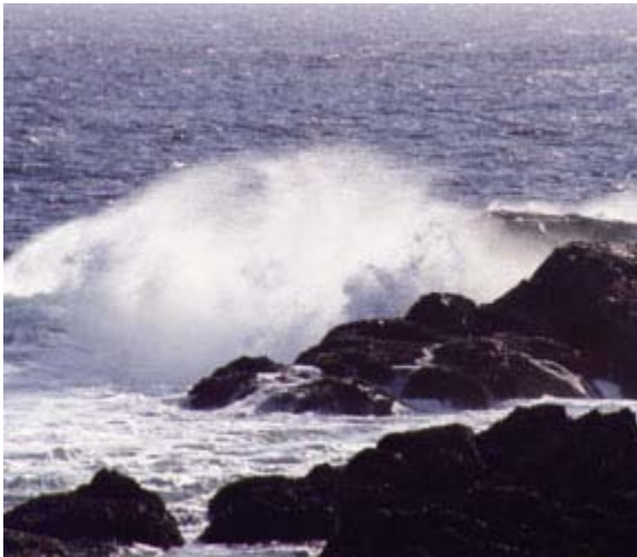
Spectacular water views near Ucluelet

The most special of all is Long Beach. Twenty five kilometers of incredibly white sandy beaches washed with rolling breakers coming off the wild Pacific Ocean. It offers some of the best "winter storm watching" available anywhere. Thirty foot waves can pound the coast during the spectacular winter storms stacking huge logs on the beach like matchsticks. On a clear sunny day you feel like you are in heaven. On a overcast day, the mysticism strengthens. The majesty of the scenery just makes you want to come back again and again.