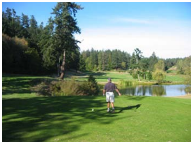
Scenic Holes at Olympic View Golf Course

An elevated green with the backdrop of a waterfall is typical of Olympic View Golf Course, also on the western side of Victoria. The 12th hole is where nightmares are born: a precise tee shot to a narrow fairway beside a long water hazard, followed by a second precise shot to an elevated green! This is just one of many challenging holes here. A golf cart is recommended for the hills. Olympic View has the best equipped practice area on any course on Vancouver Island.