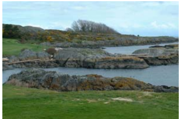
Play on the edge of the ocean at the Victoria Golf Course

Well-groomed greens, sculpted fairways and panoramic ocean views make Cordova Bay, on the eastern shore of Victoria, one of the finest courses you'll find on Vancouver Island. Four sets of tees allow you to choose the challenge that best suits your game.